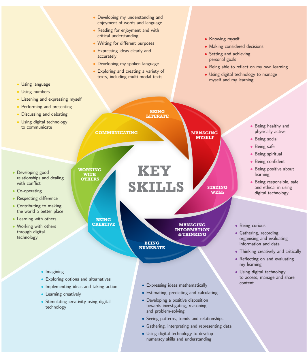
Figure 1: Key skills of junior cycle